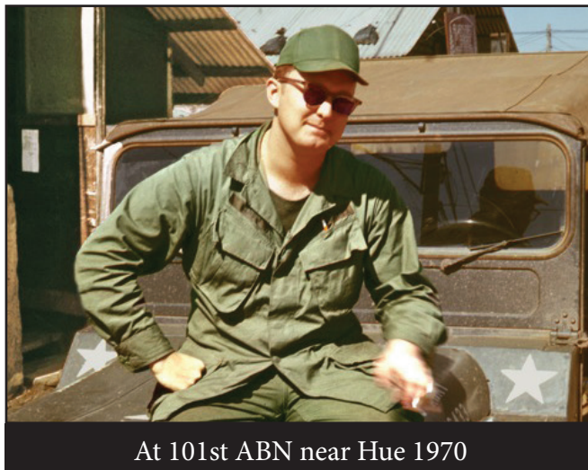
At 101st ABN near Hue 1970