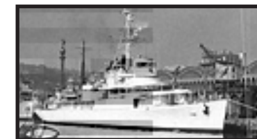
USS Greenwich Bay