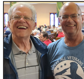
Count your Blessings