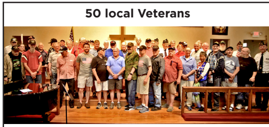
50 local Veterans