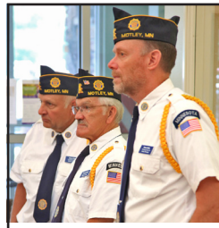
Motley American Legion Color Guard