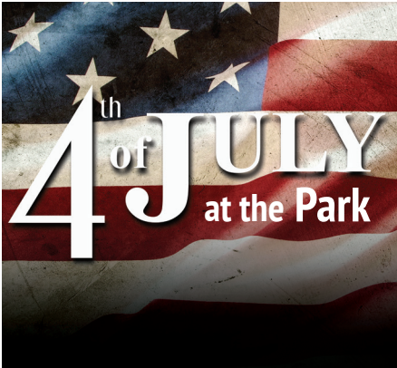
4th of July 2021