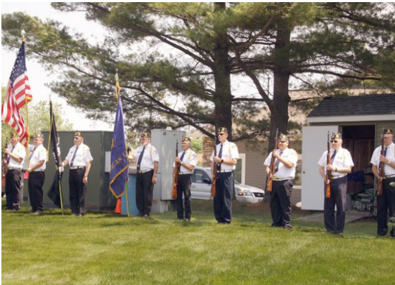
Motley American Legion Color Guard