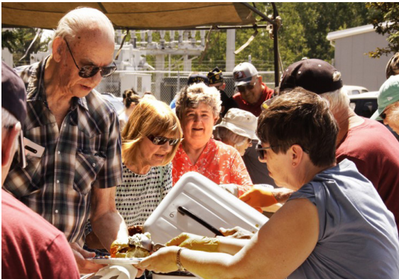
Pulled pork meal & DQ dilly bars

REMEMBER, ALL DONATIONS ARE TAX DEDUCTIBLE.