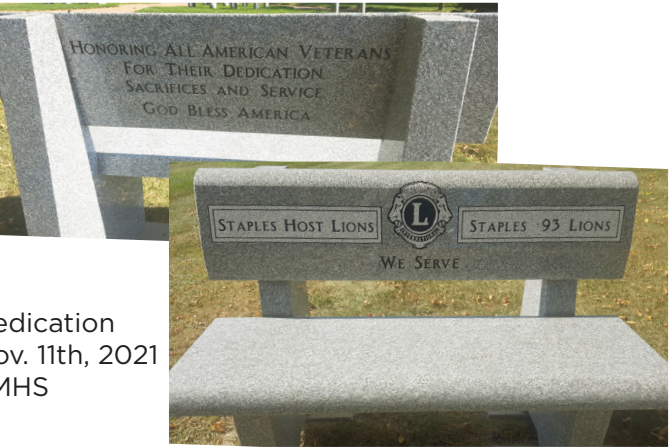
Dedication Nov. 11th, 2021 SMHS

The annual fundraising banquet will be held at Timbers Event Center on March 17, 2022. Mark your calendar. Of course scheduling this event is always dependent upon edicts and proclamations issued by our Governor.